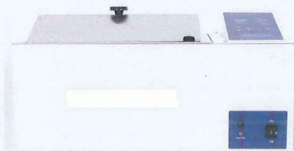
RECIPROCAL WATERBATH SHAKER (1 unit)