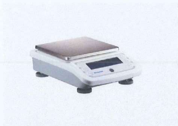
TOP LOADING BALANCE (2 units)